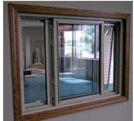
4. Once corner is in, use pull tabs to push screen frame down, make sure screen frame is secure.