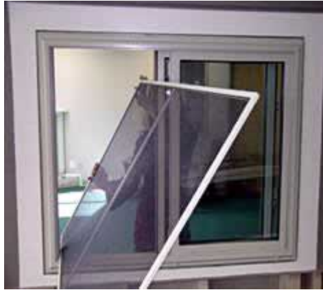
1. Reinsert screen with springs at top of screen frame.