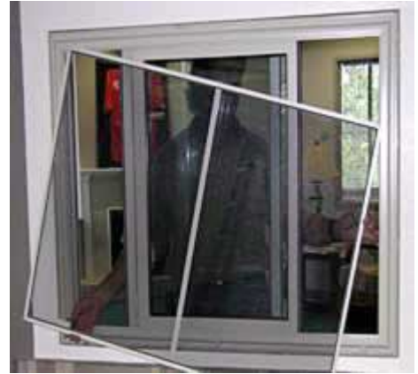
2. Insert top corners at an angle and slide.