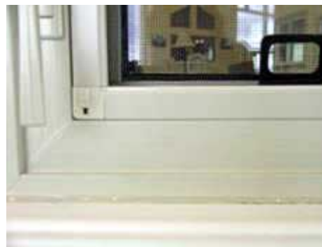
2. Push side pins back into place.