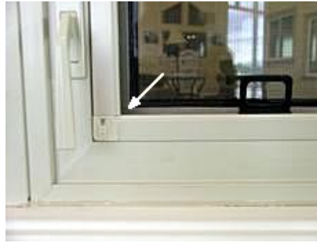
2. Locate slide pin and slide all slide pins to center.