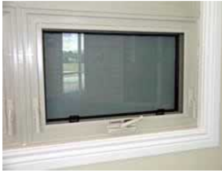
1. Casement or Awning window with screen in window