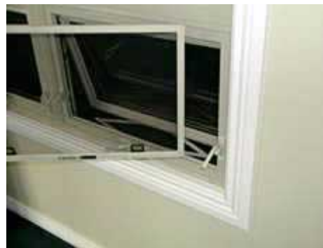
4. Screen should now be out of window.