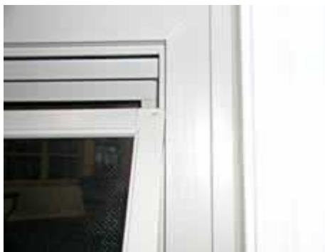
1. Realign screen frame in window. The awning may be inserted bottom first.