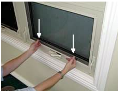
3. Lift or pull screen out by pull tabs.