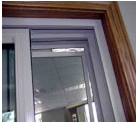
3. Once screen is at an angle and in track, slowly slide top corner to edge.